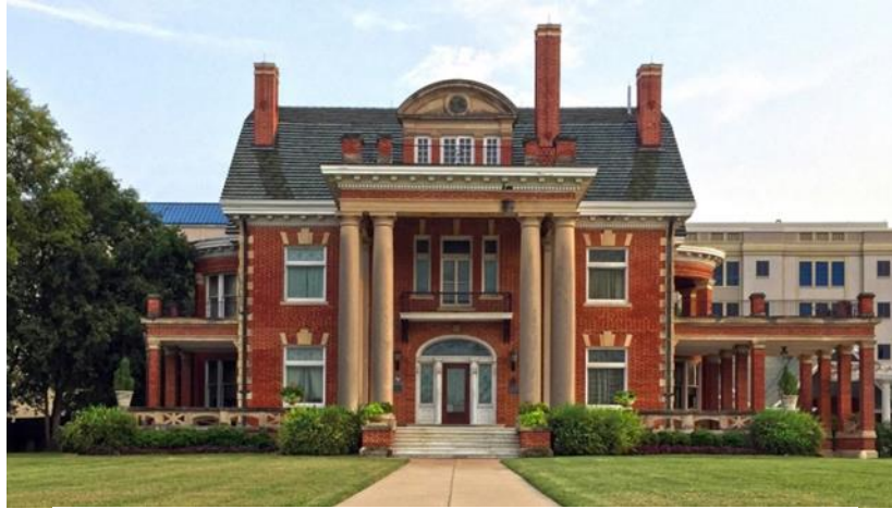
Thistle Hill-Historic Fort Worth, Inc.

Sometimes, not all parts of a city were listed in the Directories even if there were structures on the street. Address numbers also changed as structures were added to the street. Structures were also moved from one location to another adding confusion regarding dates of construction.