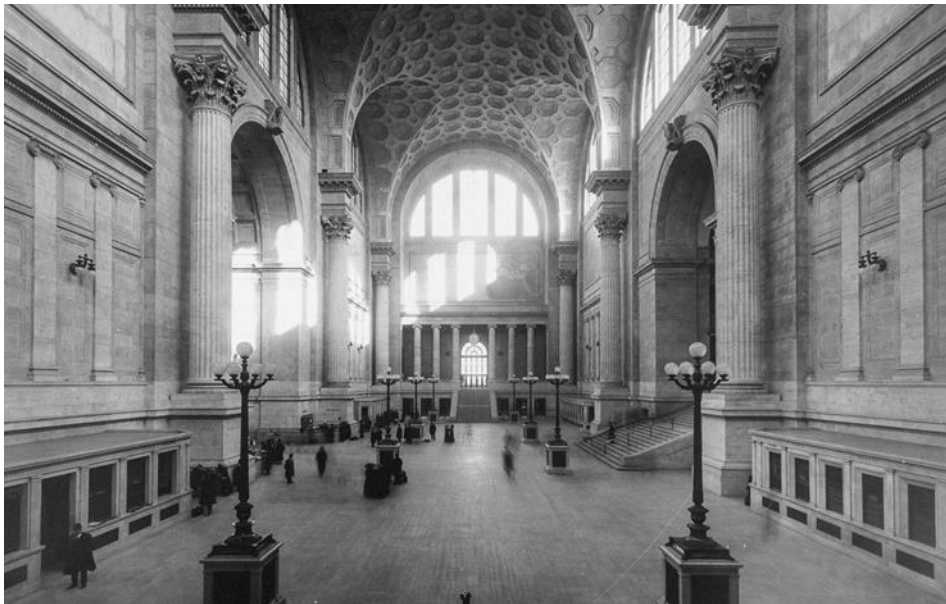
Penn Central Station in 1911

All preservation laws must be enacted in accordance with the police power. The police power is the inherent authority residing in each state to regulate, protect, and promote public health, safety, morals, or general welfare. The police power is enjoyed by the states, rather than local jurisdictions, and cities and towns can enact preservation laws only if the state has given them specific authority to do so. As noted earlier, this authority is typically bestowed on local jurisdictions either through specific enabling legislation or more general home rule power.