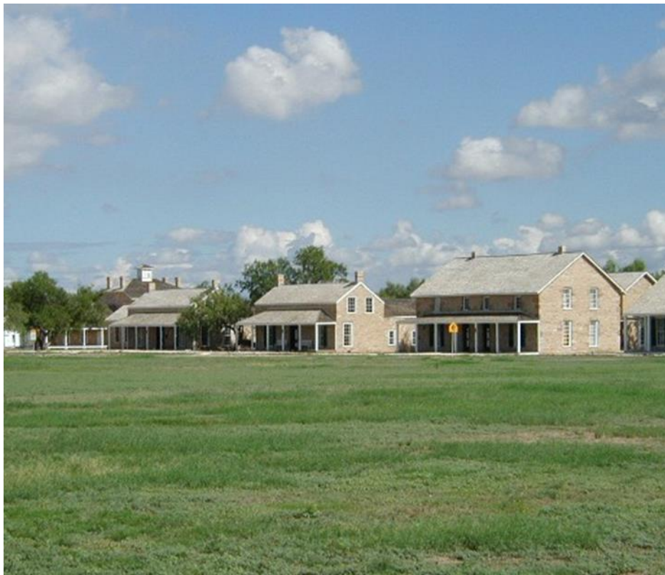
Fort Concho. A National Historic Landmark listed in the National Register.

In a very limited number of states, compensation may be required upon a showing by a private owner that the value of his or her property (and, in some cases, a portion of that property) has been diminished by a certain percentage (sometimes as low as 10 percent). While highly controversial, the impact of takings laws on historic preservation has not been documented. Nonetheless, because historic preservation laws may affect private property, these laws are likely to have some impact on efforts to regulate historic property and should be consulted where applicable.