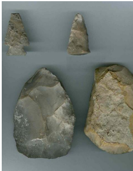
Objects found in a Native American grave site are protected under the Archaeological Resources Protection Act.

Primary regulations governing the protection of archaeological resources are set forth at 43 C.F.R. Part 7. Regulations pertaining to the preservation of American antiquities are codified at 43 C.F.R. Part 3 and regulations concerning the care of federally-owned and administered archaeological collections are located at 36 C.F.R Part 79. These laws and additional information are available on the National Park Service's website at http://www.nps.gov/Archeology/sites/FEDARCH.HTM .