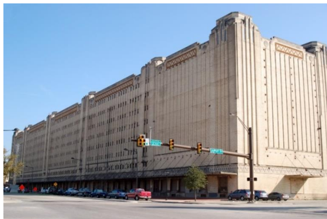
1931 Texas and Pacific Warehouse Building, 401 West Lancaster Avenue Fort Worth, Texas