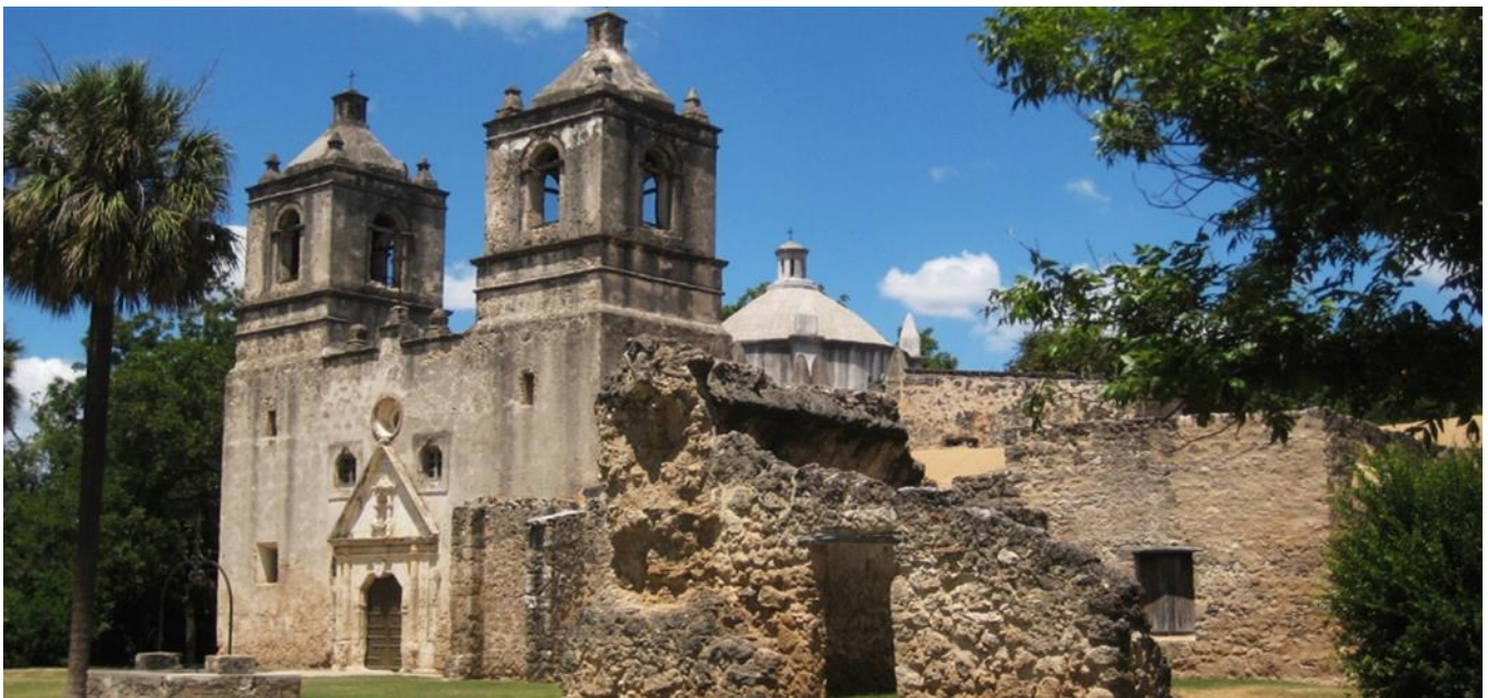
Mission Concepcion in San Antonio is listed in the National Register and is a National Historic Landmark.

The Supreme Court in Smith , however, recognized two limitations on its general rule that substantial burdens on the free exercise of religion need not be justified by a compelling governmental interest: (1) where the government “has in place a system of individual exemptions;” and (2) where the substantial burdens involves another constitutionally protected right. There is little guidance on the law in this area. Constitutional experts maintain that exceptions under historic preservation laws, such as “economic hardship provisions,” do not trigger the “individualized exemptions” limitation because they do not invite “religiously motivated discrimination.” See, e.g., Laura S. Nelson, “Remove Not the Ancient Landmark: Legal Protection for Historic Religious Properties in an Age of Religious Freedom Protection,” 21 Cardozo Law Review 740-753 (Dec. 1999). Compare Keeler v. Mayor & City Council , 940 F. Supp. 879 (D. Md. 1996) (exemptions in Clumberland historic preservation ordinance made law not neutral and generally applicable as a matter of law). While some religious property owners have argued that historic preservation laws fall into the “hybrid” constitutional rights limitation on the basis that such laws infringe on both free exercise and free speech rights, no court has applied this limitation in the context of historic properties.