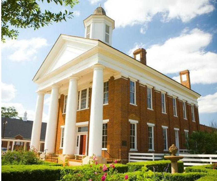
The Old University Building on the campus of Stephen F. Austin University in Nacogdoches is a State Antiquities Landmark

Sec. 442.005 of the Antiquities Code lays out the powers for the THC. It directs the commission to furnish leadership, coordination, and services to county historical commissions, historical societies, and the organizations, agencies, institutions, museums, and individuals of this state interested in the preservation of archaeological or historical heritage and shall act as a clearinghouse and information center for that work in Texas. The THC is responsible for the administration of the Antiquities Code of Texas, Chapter 191, Natural Resources Code, and shall strive to establish effective working relationships among individuals primarily interested in history, architecture, and archaeology.