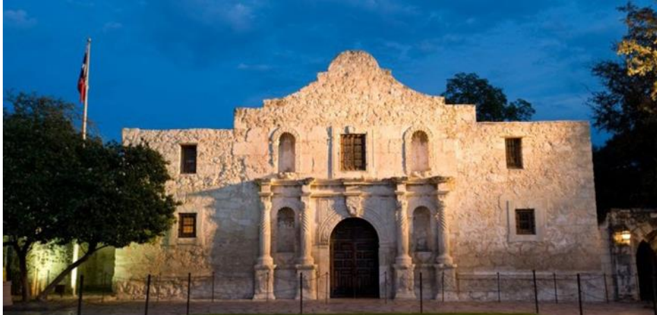
The Alamo is listed in the National Register and is also a National Historic Landmark