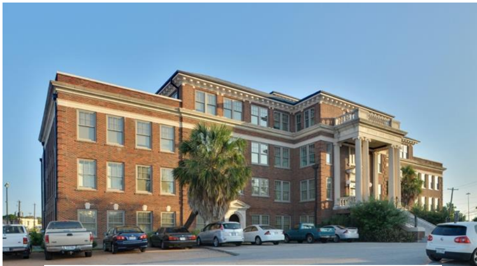
The Jefferson Davis Hospital in Houston

The Texas Historic Preservation Tax Credit Program was created by the Texas House Bill 500 and went into effect on January 1, 2015. The program is overseen by the Texas Historical Commission (THC) and the Texas Controller of Public Accounts. The administrative rules are in Texas Administrative Code, Title 13 Part II, Chapter 13. The Texas Historic Preservation Tax Credit Program is worth 25% of eligible rehabilitation costs. Applicants are encouraged to apply to both the Texas Historic Preservation Tax Credit Program and the Federal Rehabilitation Tax Credit Program. Please reference THC website http://www.thc.texas.gov/preserve/projects-and-programs/preservation-tax-incentives/texas-historic-preservation-tax-credit .