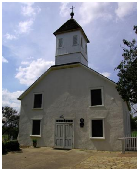
Bethlehem Lutheran Church, Round Top, TX

Historic preservation laws are generally viewed as “neutral laws of general applicability.” The object of such laws is to promote the preservation of historic properties, rather than the suppression of religious conduct. Moreover, they seek to preserve all historic properties, whether secular or religious, and without regard to the religious orientation of the property owner. See, e.g. Rector, Warden & Members of the Vestry of St. Bartholomew’s Church v. New York City , 914 F. 2d 348 (2d. Cir. 1990), cert. denied , 499 U.S. 905 (1991) (New York City’s landmark law is neutral of general applicability); First Church of Christ v. Ridgefield Historic District Comm’n , 737 A. 2d 989 (Conn. App. 1999), (Ridgefield historic preservation ordinance is neutral law of general applicability); and City of Ypsilanti v. First Presbyterian Church of Ypsilanti , No. 191397 (Mich. Ct. App. Feb. 3, 1998) (Ypsilanti preservation ordinance is “a law of general application which does not burden the church any more than other citizens, let alone burden [the church] because of its religious beliefs.”).