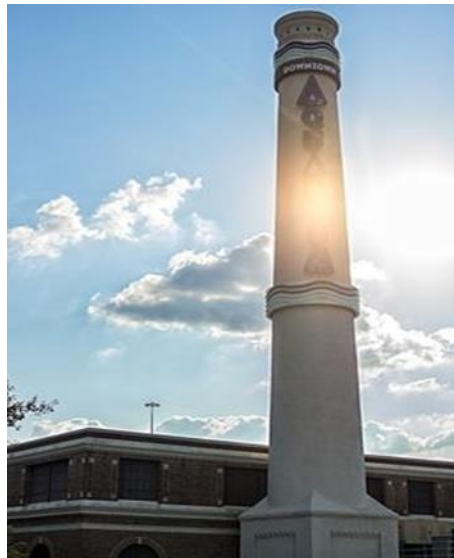
1879 Houston Waterworks

The THC designates State Antiquities Landmarks (SALs). Buildings designated as SALs are listed in the Texas Historic Sites Atlas. Designated landmarks are protected under the Antiquities Code of Texas. Historic buildings must be listed first in the National Register to become a State Antiquities Landmarks; however, archaeological sites do not have this requirement.