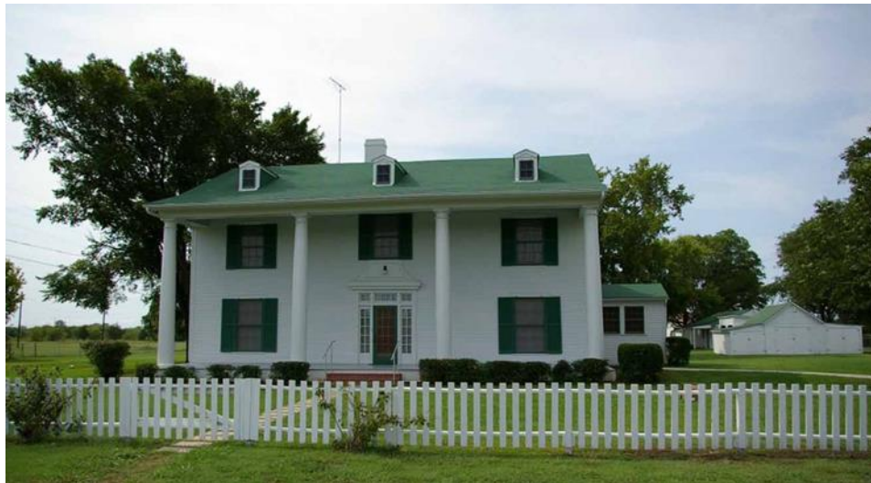
Samuel T. Rayburn House. Listed in the National Register and is a National Historic Landmark.

Many of our nation's most important historic properties are preserved as house museums. This form of protection generally involves restoration of the interior and exterior of the building and preservation of the surrounding landscape. Because house museums are generally open to the public, they often play a key role in attracting tourism to specific areas.