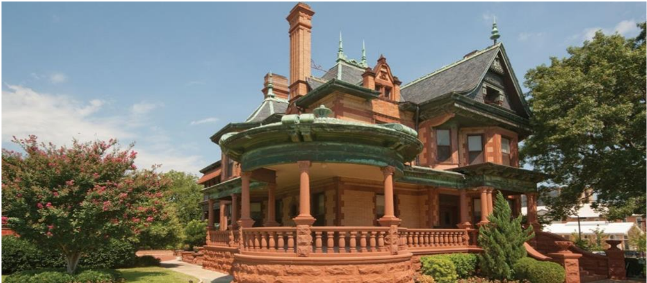
Ball-Eddleman-McFarland House Historic Fort Worth, Inc.

The federal government encourages the donation of historic property through its charitable giving rules. Generally speaking a taxpayer is entitled to a deduction from taxable income or taxable estates and gifts, the amount of money or the fair market value of property donated to a charitable organization. With respect to charitable contribution deductions from income, the value of the deduction may depend upon the taxpayer’s adjusted gross income and the type of property donated. Deductions for estate and gift tax purposes, however, are generally unlimited.