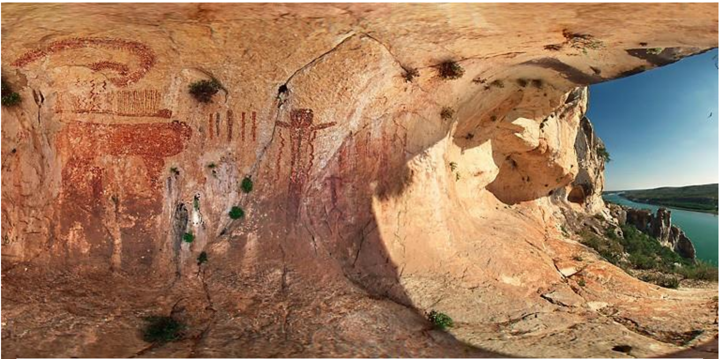
The White Shaman Mural on the Pecos River. The Antiquities Act was passed to protect such sites from looters.